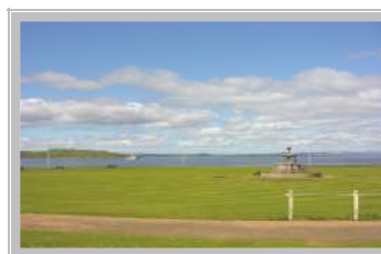
View from Flat