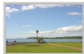
View from Flat